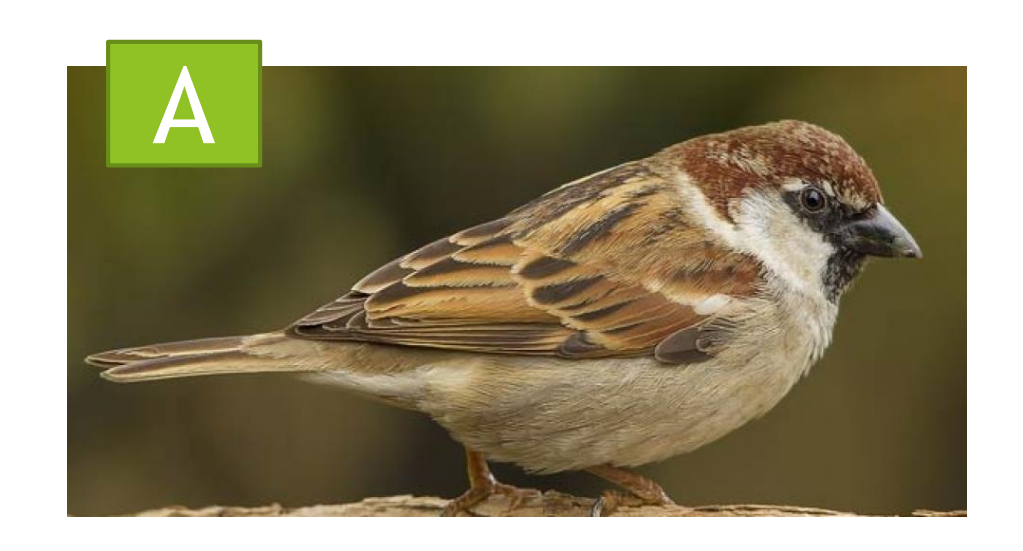
Is it A or B?

This is a protected bird. It's small. It's got a long tail. It's brown and grey.